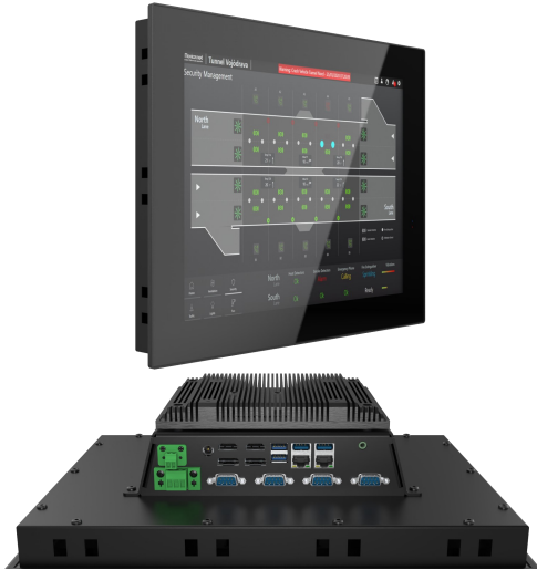
PanelPC-G150X - 11G Made in ITALY