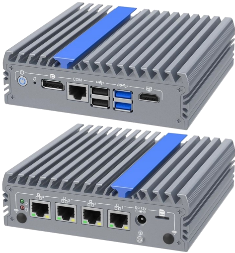
NET N100 FANLESS IPC