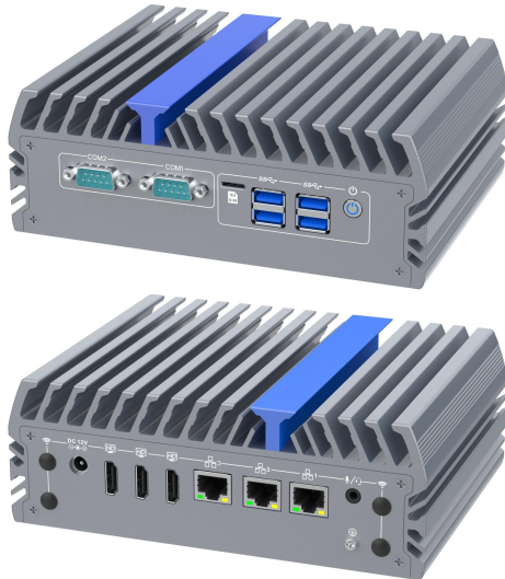
SILVER i7 1255U FANLESS IPC